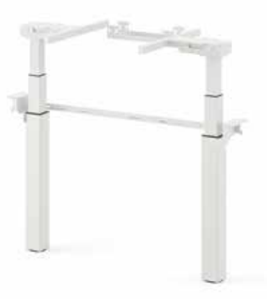
Height settable insert kit for 800 deep desktop Individual height adjustable position